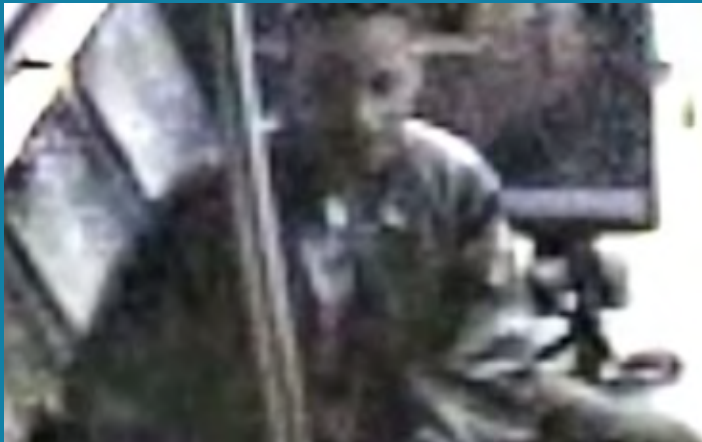
Pixelated Image as a result of magnification/zooming.

“It may be prudent to seek the expertise of a trained professional to assist with an effective solution to your security problem.”