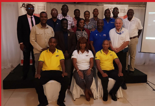
Chapter members at the AGM.