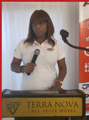
Chairperson addresses the AGM.